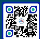
SURE 60 GURUKUL