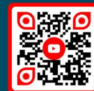
SURE 60 GURUKUL